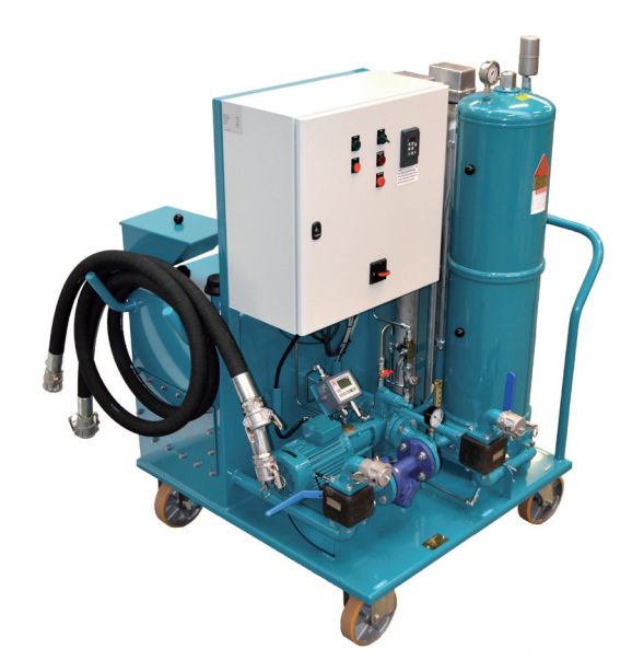
The CJC™ Mobile Flushing Unit, MFU HDU 27/108 GP