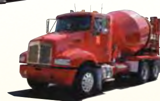
On-road trucks, tractors and trailers