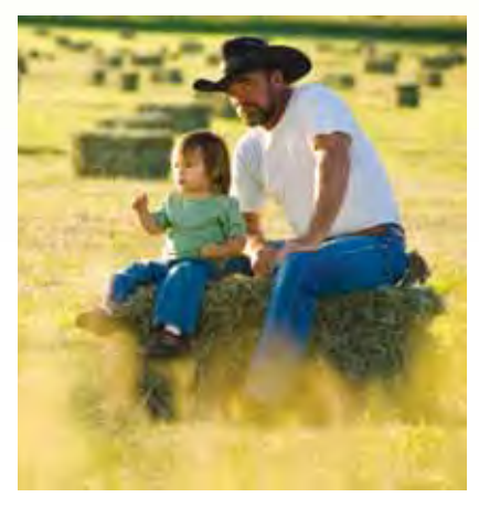
Have time for the other things you love.

With a Graco automatic lube system, maintenance is easy. A central pump and grease reservoir is located at a convenient, accessible location. The pump replenishes grease in small metered amounts as it's used and ensures every bearing is lubricated when it needs it most—while it's in use. Protect your investment by keeping more money in your pocket and contaminants out of your bearings.