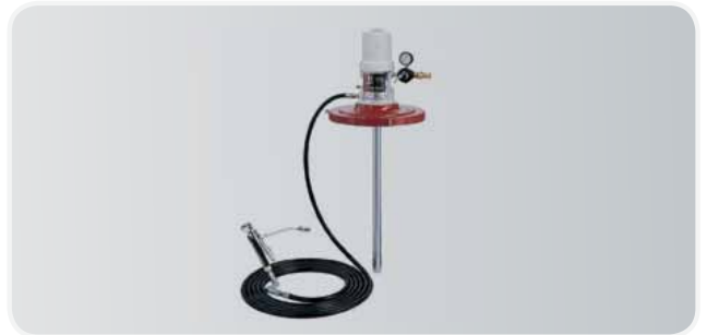
Grease Systems & Pumps