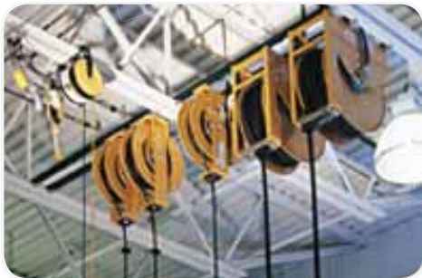
Workshop Lube Systems