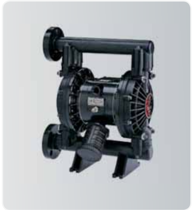
Husky 1040 1" (25.4 mm)