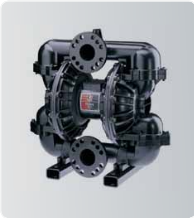
Husky 3275 3" (76.2 mm)