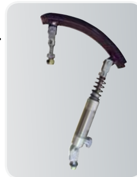
PB693 Air Brake Assembly