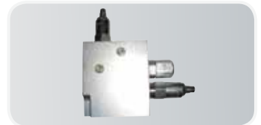
688808 Brake Manifold