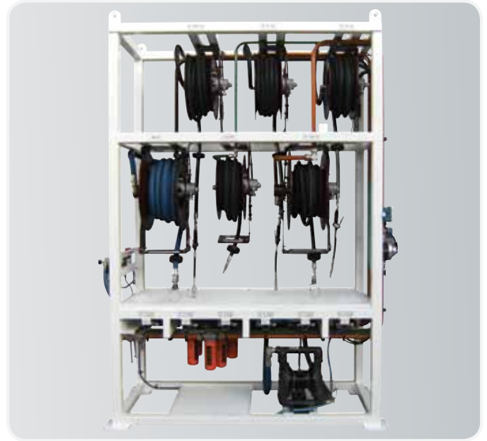
Hose Reel Stand