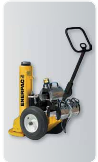
PRASA10027L Pneumatic Air Pump Lifting Jack 90 ton (kN) Capacity